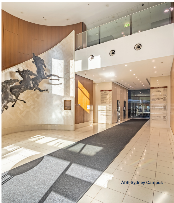
AIBI Sydney Campus

📍 Level 5 / 440 Elizabeth St, Melbourne VIC 3000