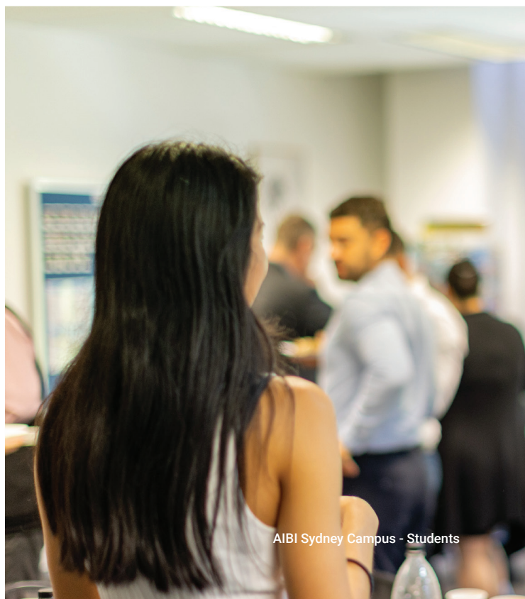
AIBI Sydney Campus - Students