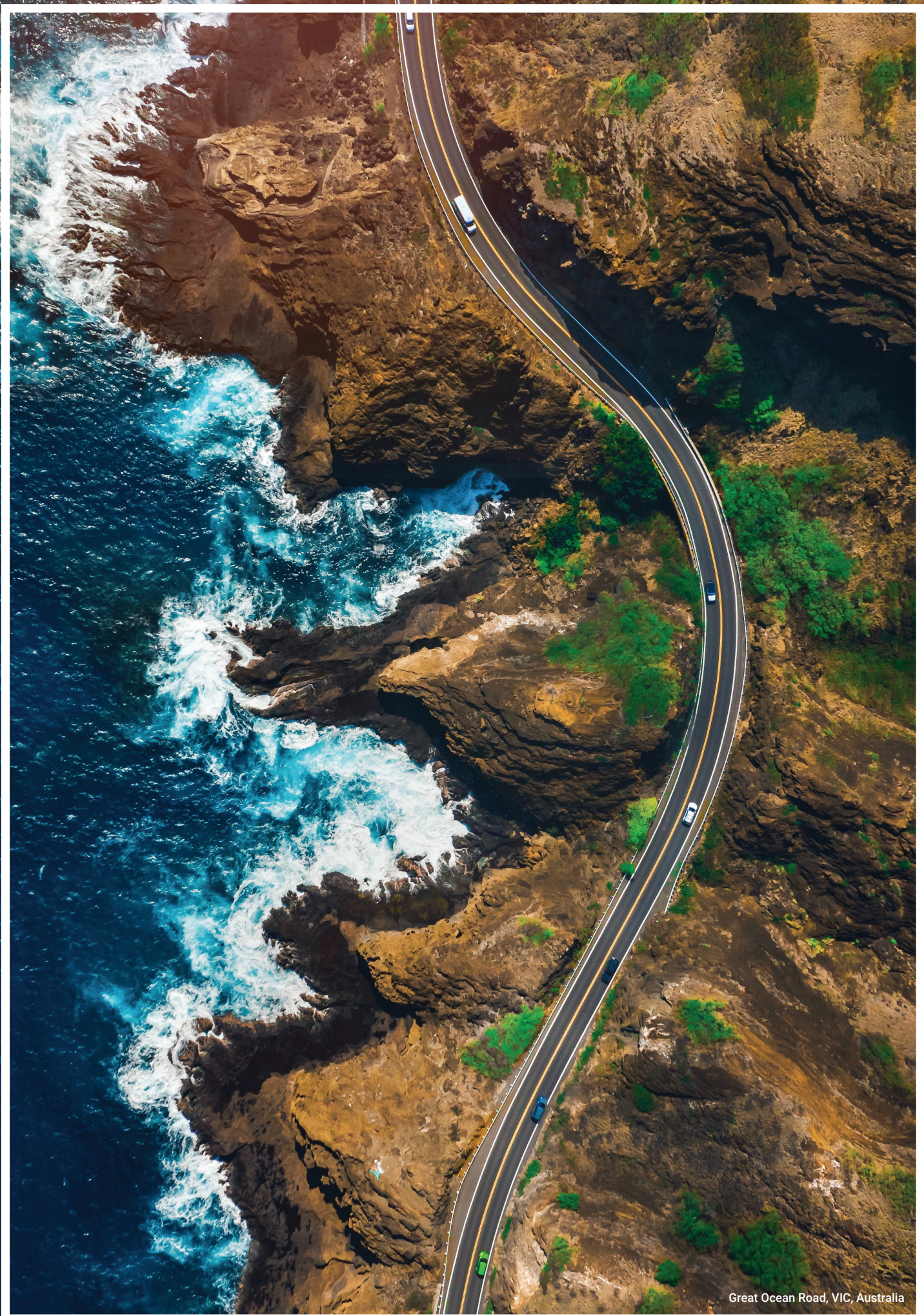
Great Ocean Road, VIC, Australia