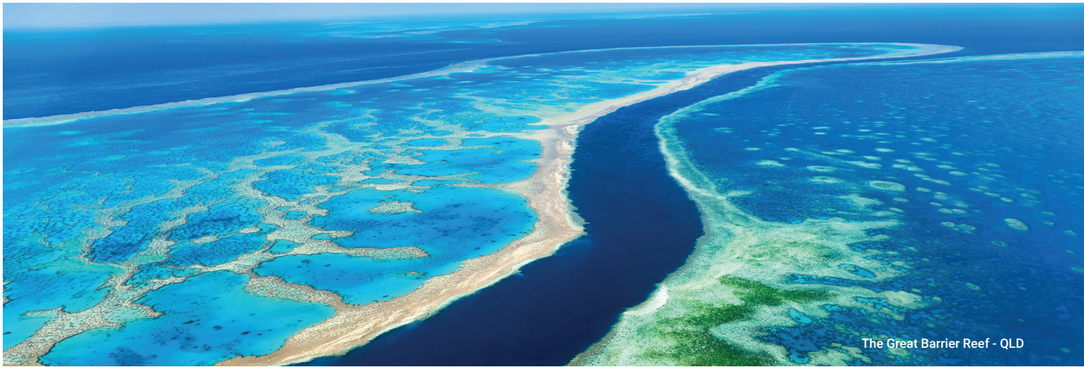
The Great Barrier Reef - QLD