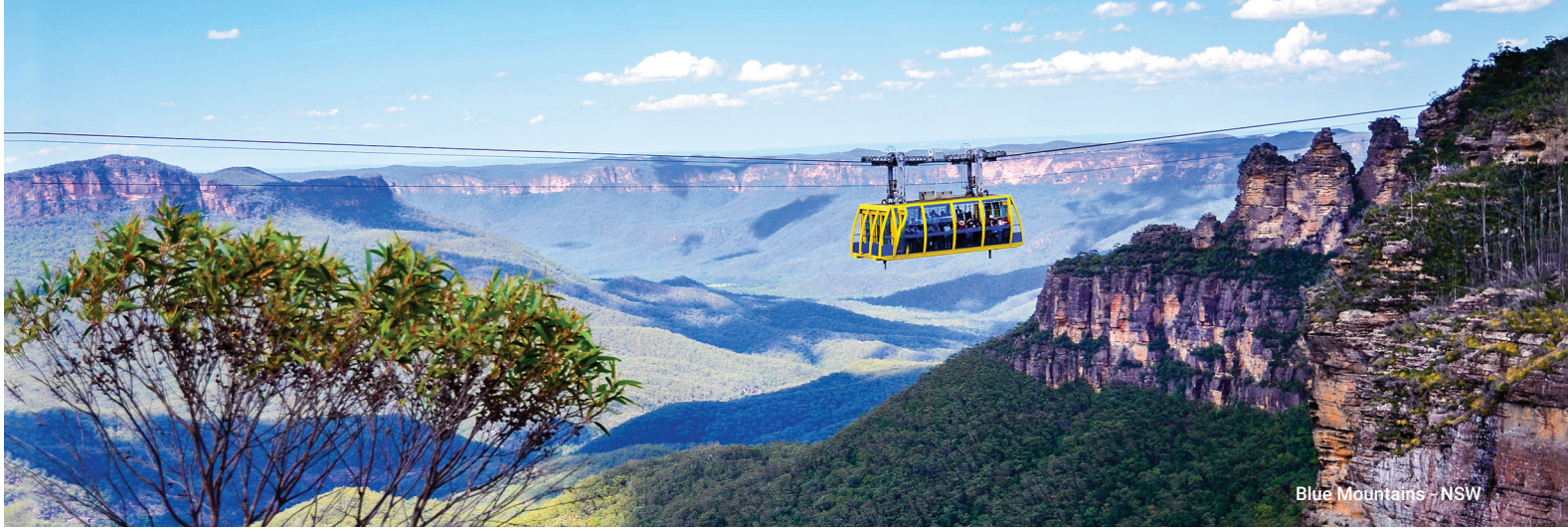
Blue Mountains - NSW