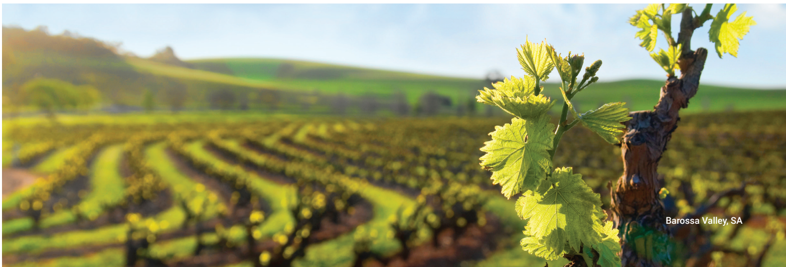
Barossa Valley, SA