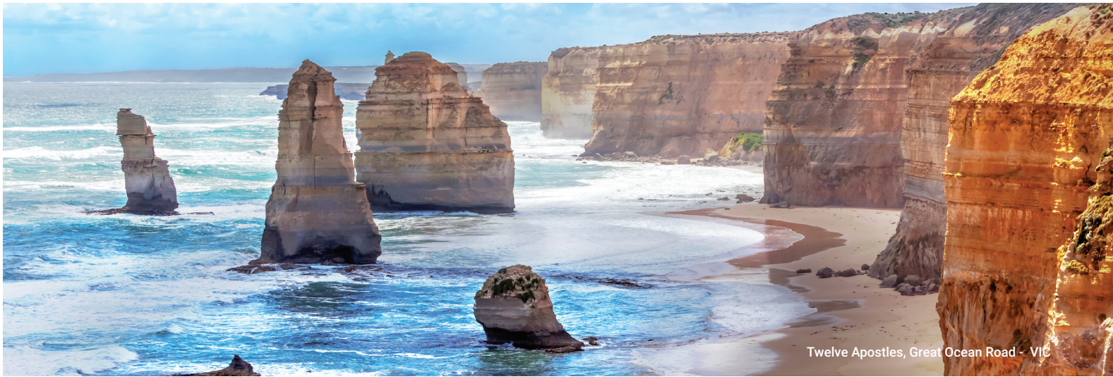
Twelve Apostles, Great Ocean Road - VIC