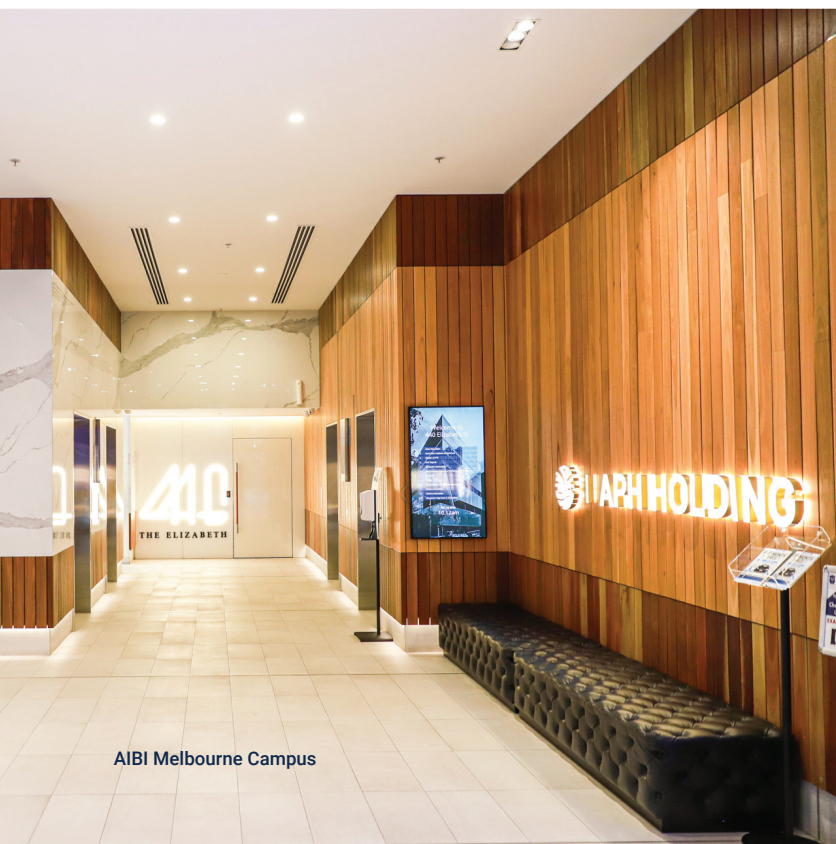
AIBI Melbourne Campus

Students whose first language is not English will need to provide evidence of English language proficiency. For more information on English requirements, refer to the How to Apply page on the AIBI HE website: aibi.edu.au/how-to-apply/