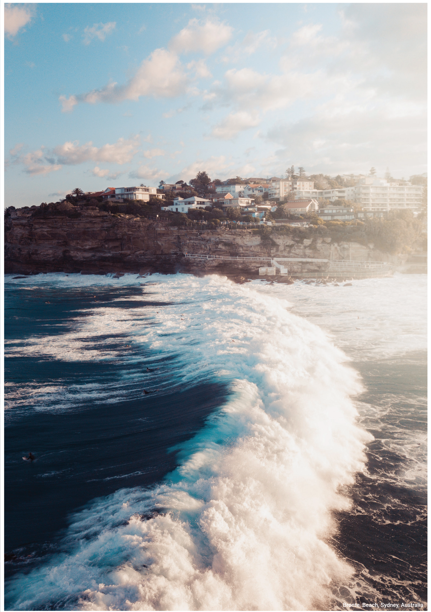
Bronte Beach, Sydney, Australia